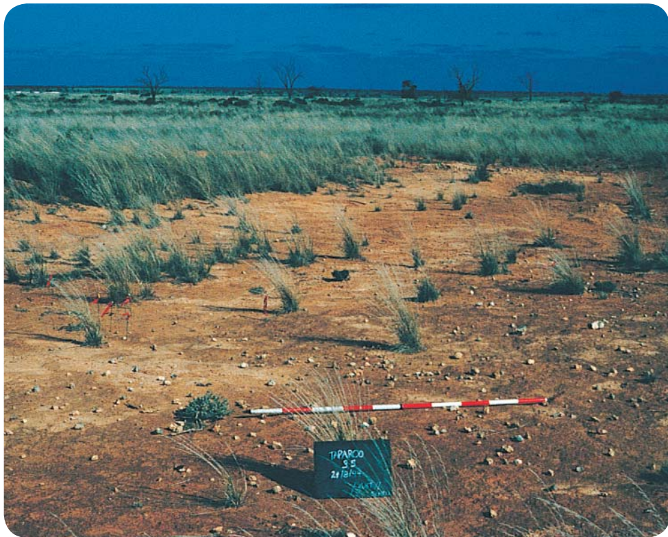
A typical surface scatter found when an older land surface has been exposed