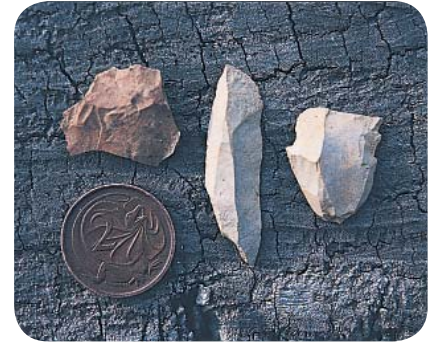
Stone Artefacts like these are commonly found in Victorian surface scatters

Aboriginal surface scatters can be disturbed or destroyed by people or natural processes such as wind and water. Weathering and erosion can damage or disperse artefacts,