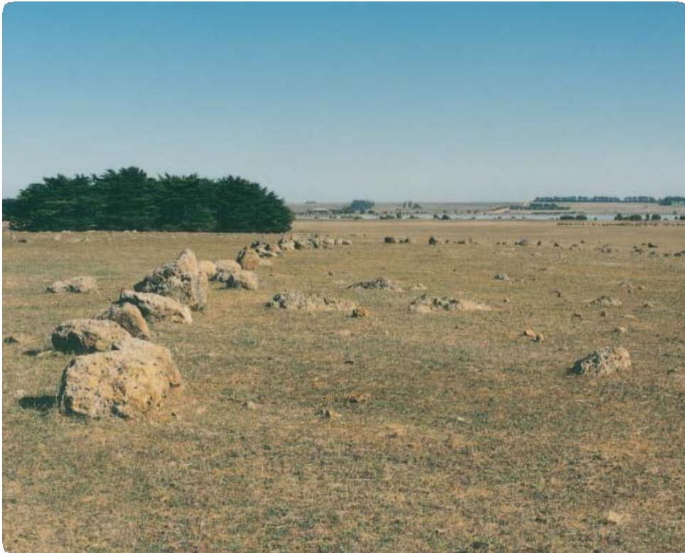
Lake bolac Stone Arrangement