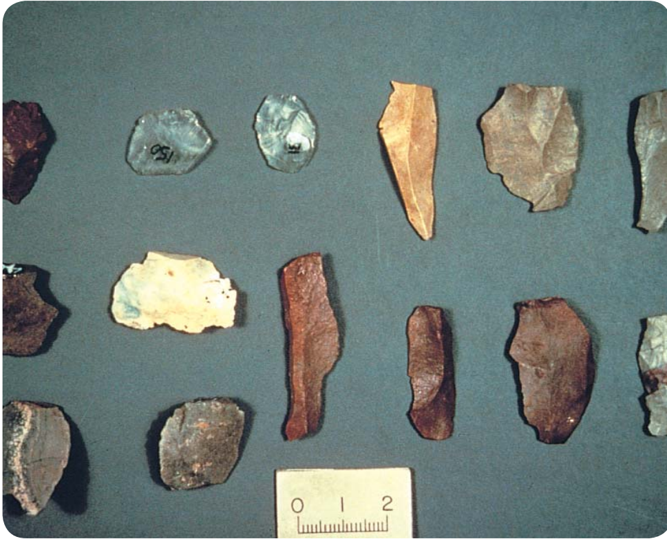
A group of artefacts of different size, shape and material