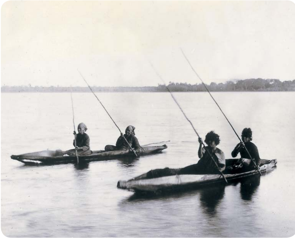
Aboriginal people in canoes on Lake Tyers 1886